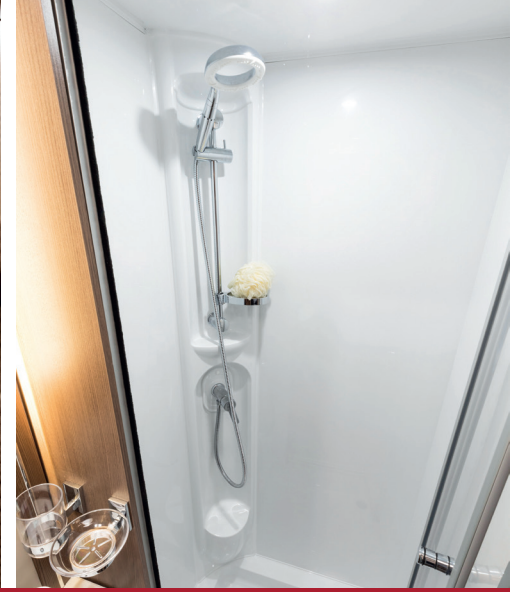
Elddis Encore motorhomes boast Alde 24hr programmable central heating for hot water on-demand. 100L water and waste tanks come as standard - and Ecocamel shower heads ensure your water goes further!