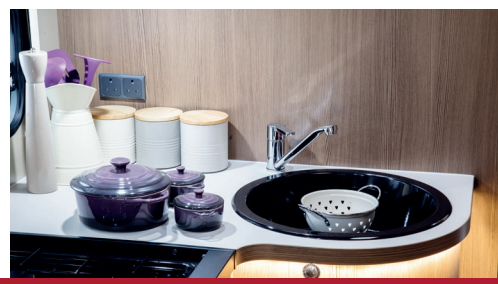
With its dual-fuel hob oven, grill, 800W microwave, smart-energy fridge-freezer and capacious storage, the Encore range is more than equipped for every adventure.