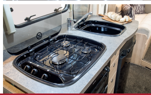
Kitchens are well-equipped with domestic-style appliances for a real home-from-home feel.