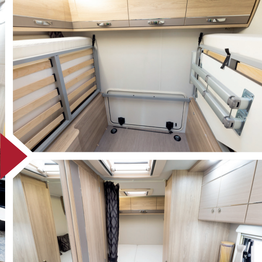
Rear hatch on Accordo 125 and 135. Shown here Accordo 125 with full-width transverse rear bed and storage area.